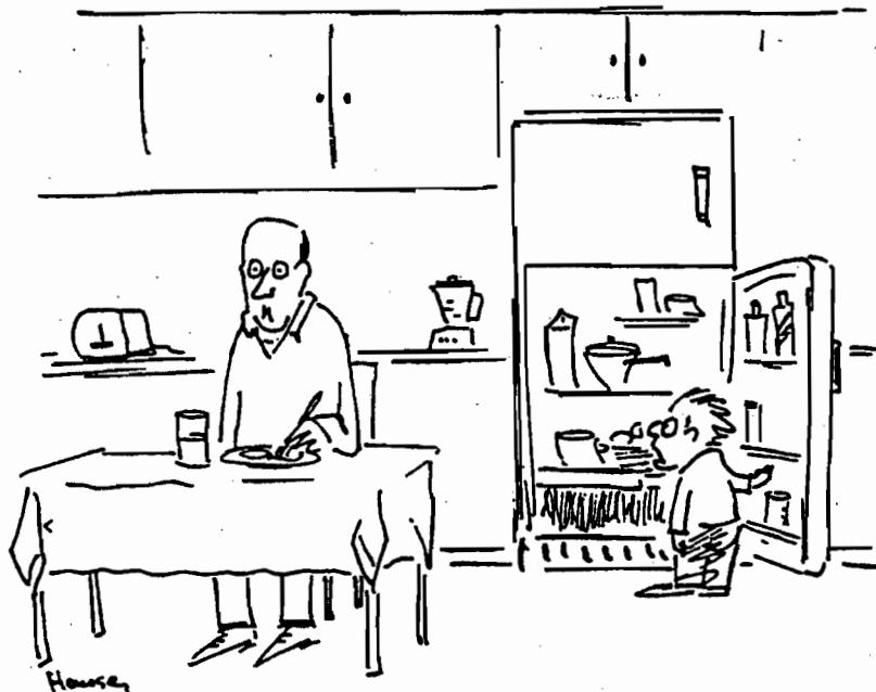
"Omigosh! My science project is gone!"

The "construction zone" encompasses what a child is developmentally ready to consider. Any new information or skills needed for conceptual change may lie outside the zone if the child is developmentally unprepared to learn them. O'Brien's students who cheered when the temperature inside the "warm" clothes rose a single degree evinced such unpreparedness. They failed to recognize that the single degree was an insignificant rise and may even have resulted from a misreading of the thermometer. Conceptual change can take place only within the